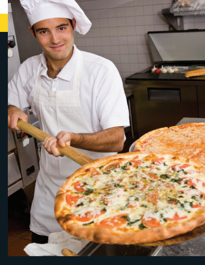
"Discover The Possibilities"